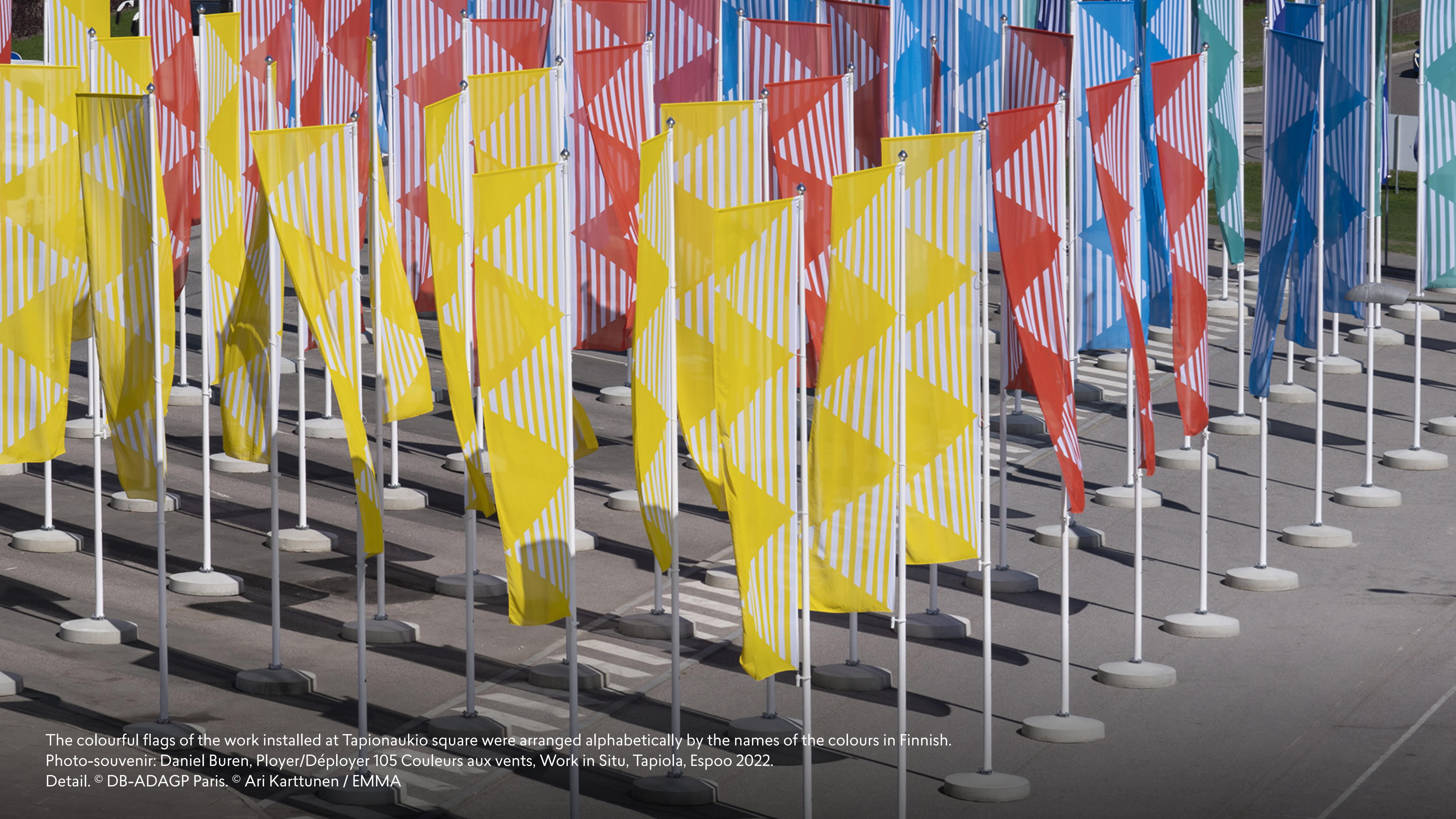
The colourful flags of the work installed at Tapionaukio square were arranged alphabetically by the names of the colours in Finnish. Photo-souvenir: Daniel Buren, Ployer/Déployer 105 Couleurs aux vents, Work in Situ, Tapiola, Espoo 2022. Detail. © DB-ADAGP Paris.