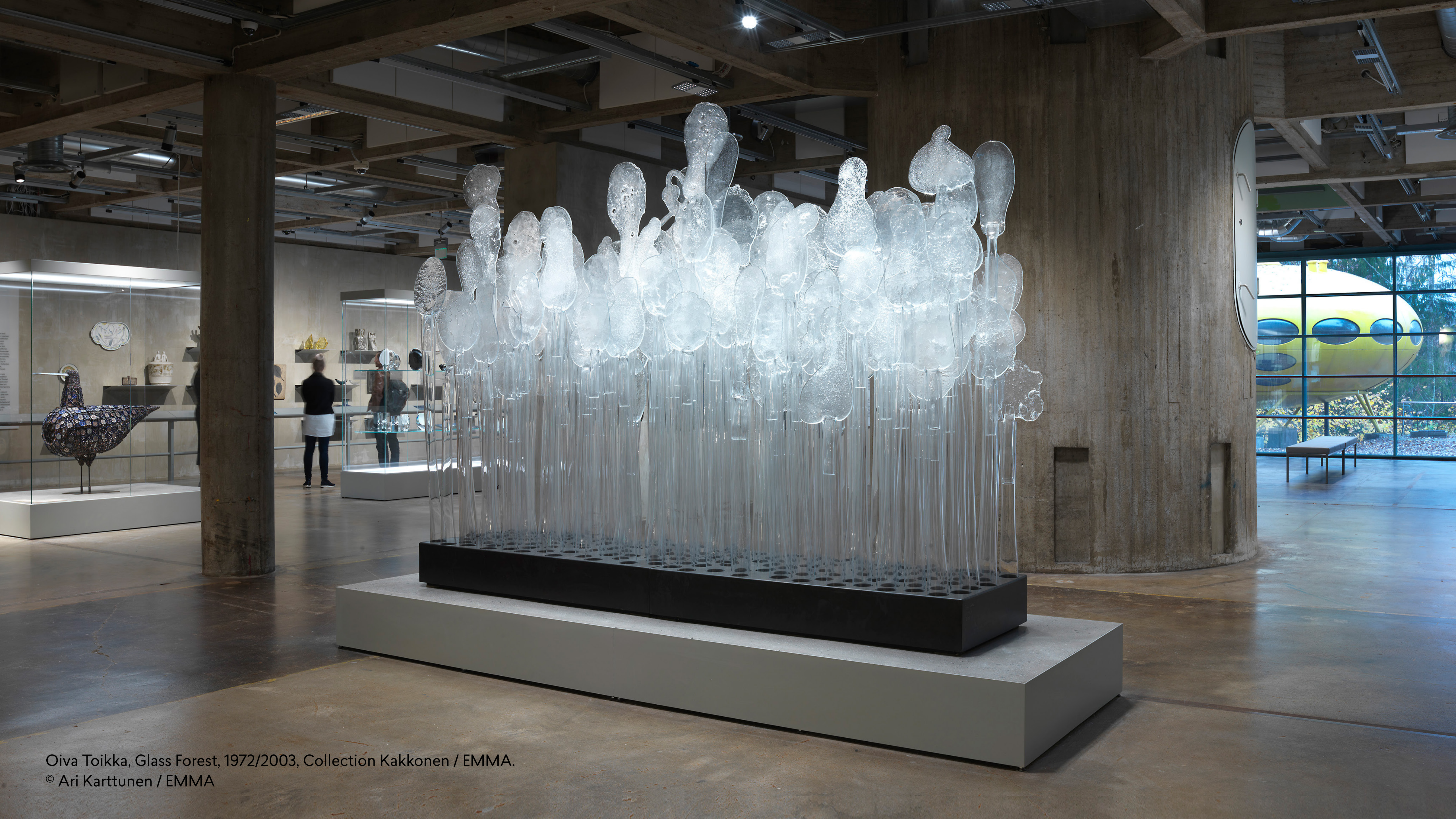
Oiva Toikka, Glass Forest, 1972/2003, Collection Kakkonen / EMMA.