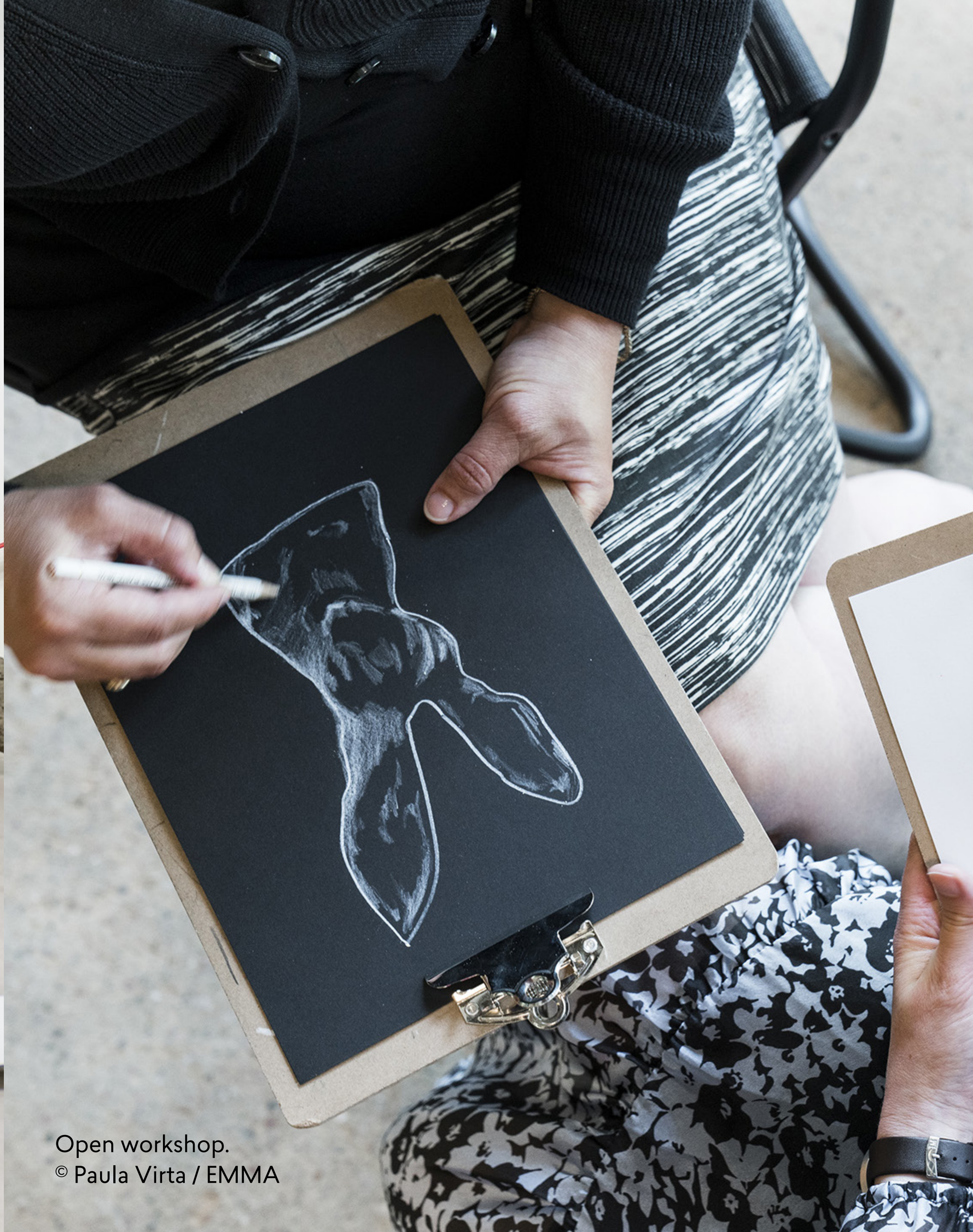
Open workshop.