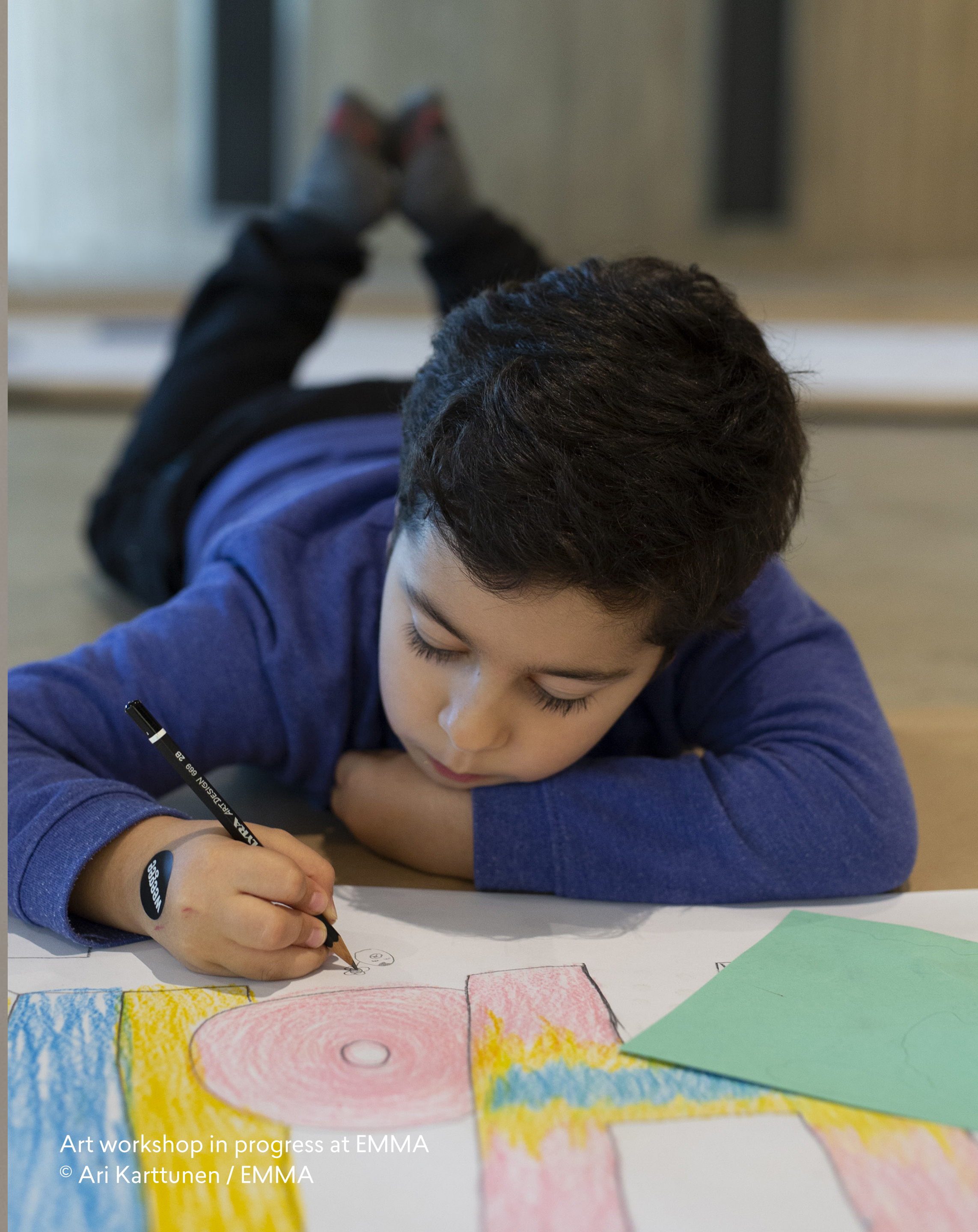
Art workshop in progress at EMMA