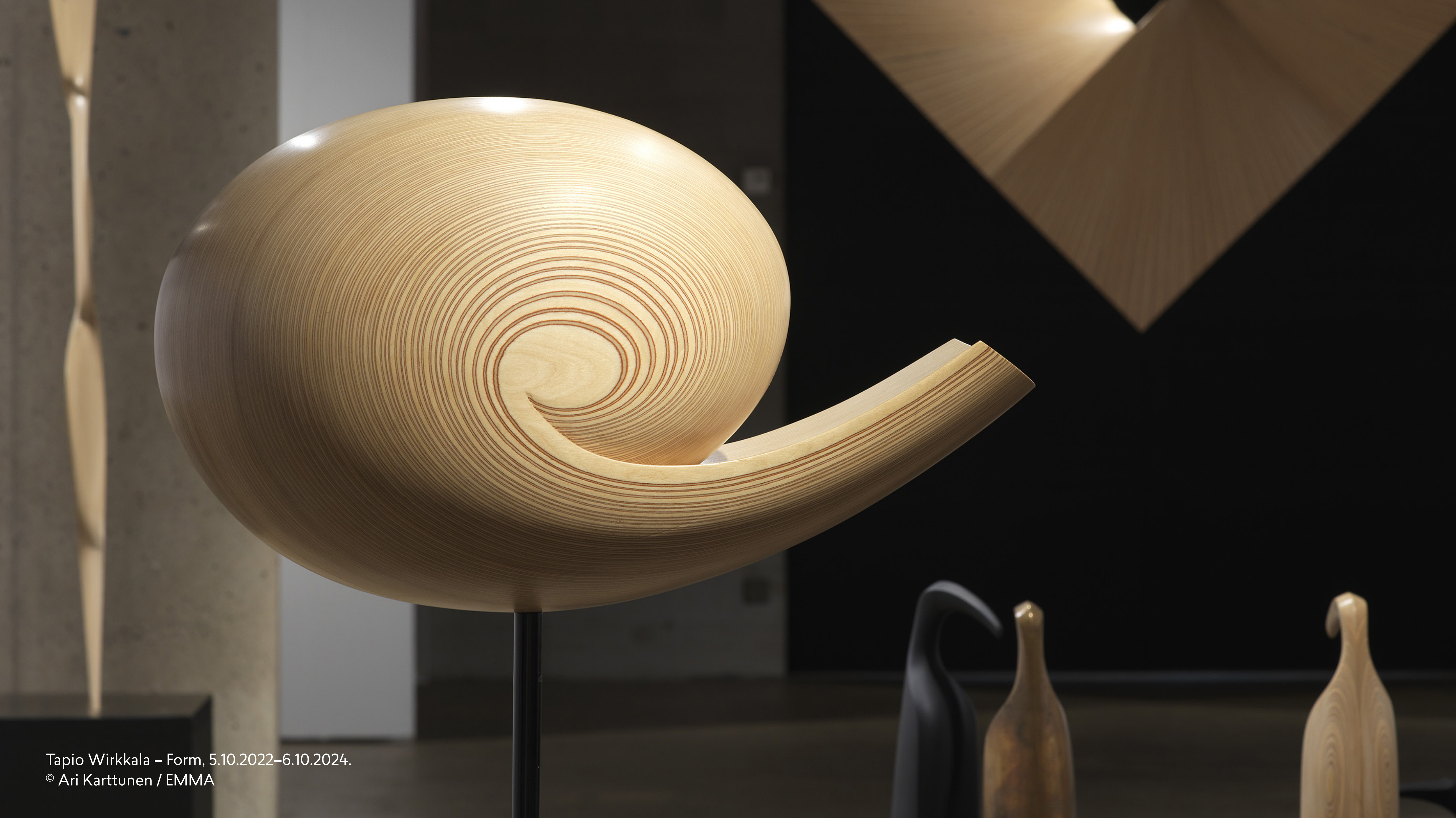
Tapio Wirkkala – Form, 5.10.2022–6.10.2024.