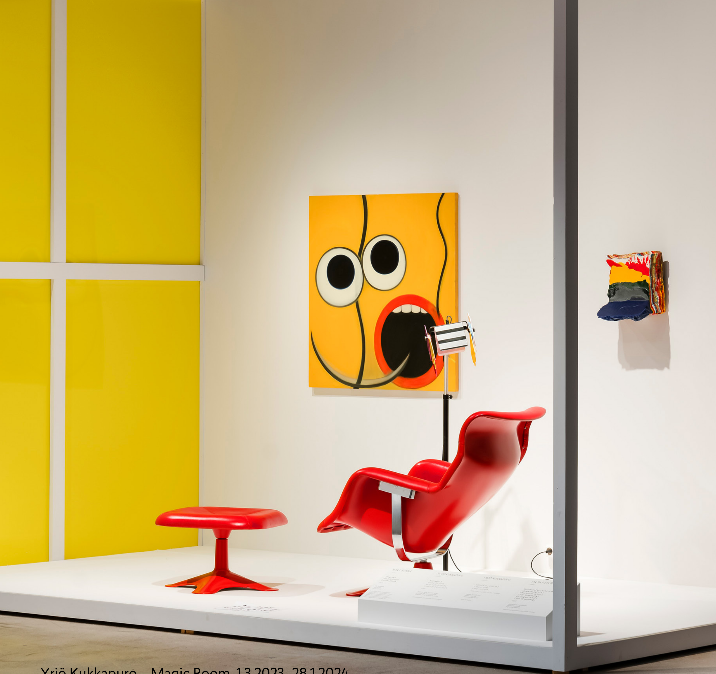
Yrjö Kukkapuro – Magic Room, 1.3.2023–28.1.2024