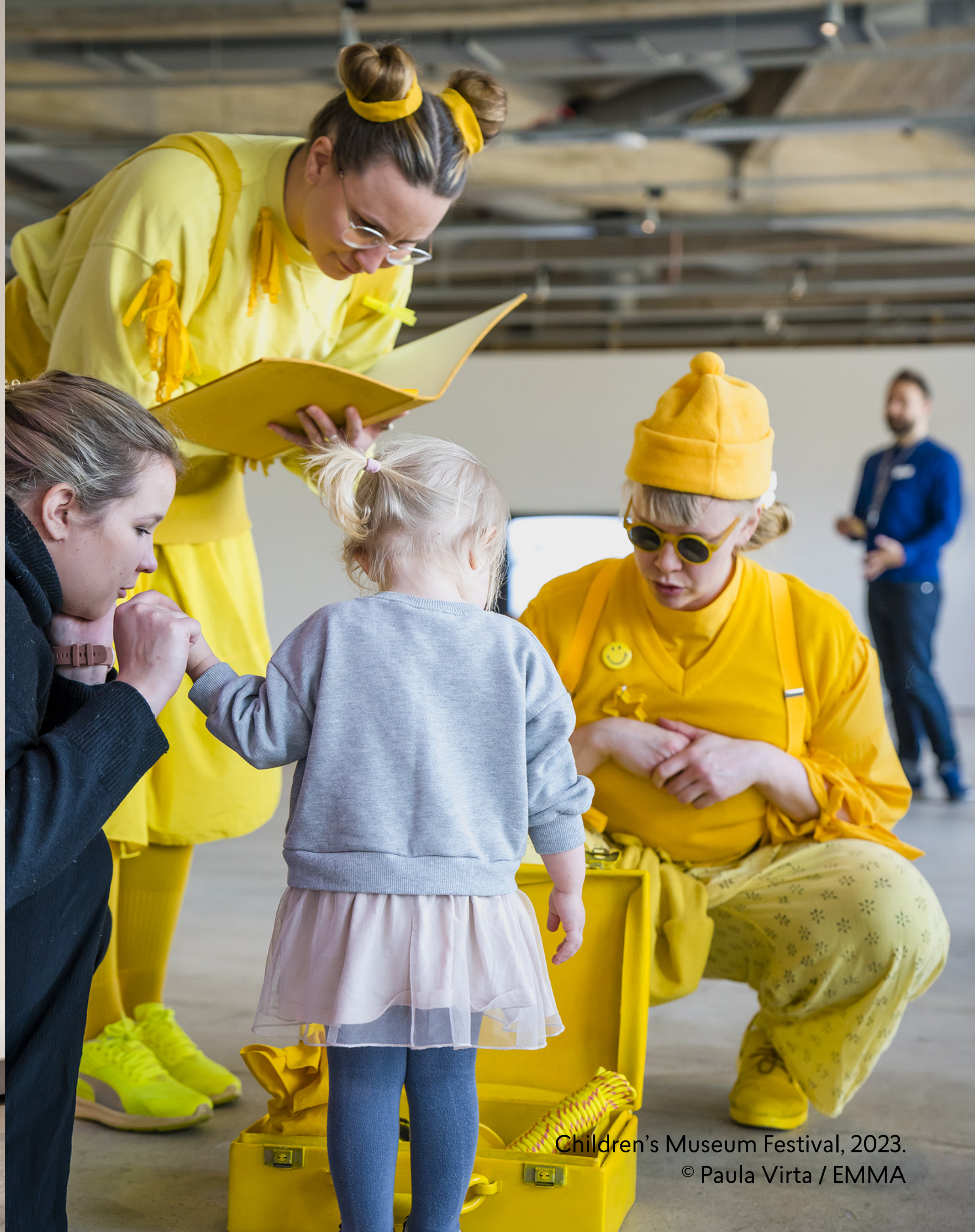
Children's Museum Festival, 2023.